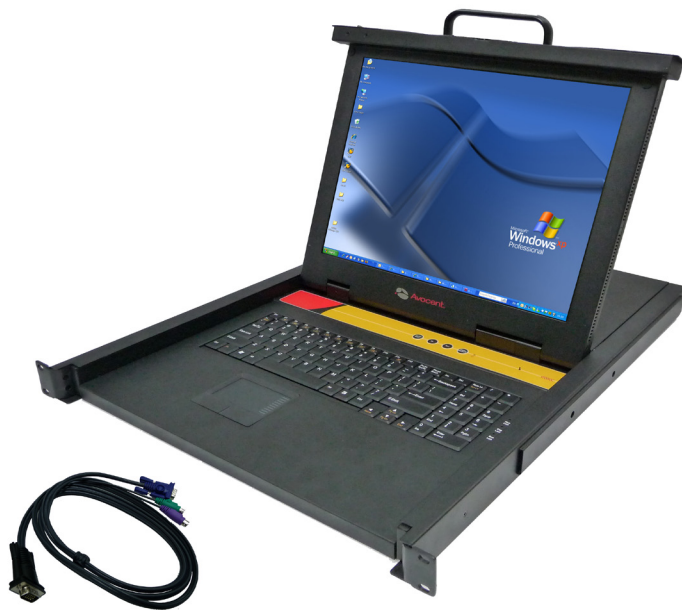
Front view of the LCD console with integrated KVM switch and combo KVM cable that connects to the back of the LCD tray and provides USB or PS/2 cables.

When you need direct access that you can depend on, the Avocent LCD console is a proven solution.